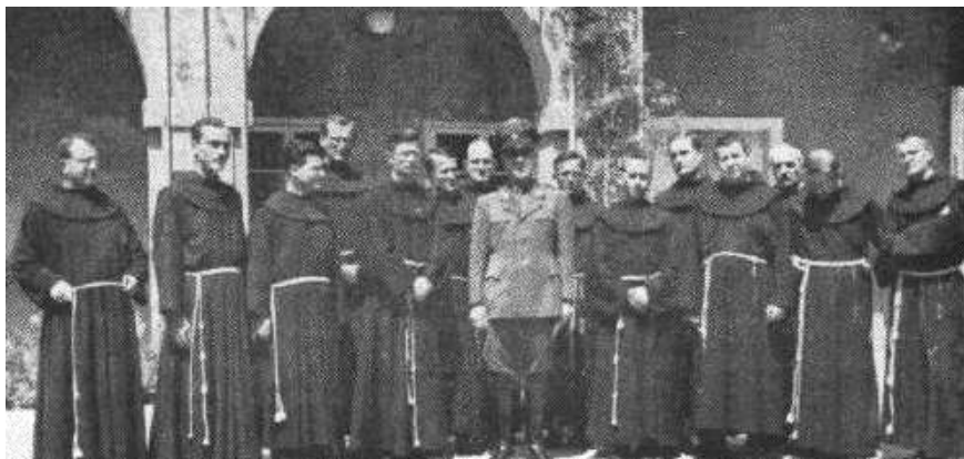
Anton Pavelic with Franciscan Monks

During Pavelic's four-year reign, he and Roman Catholic Prelate, Archbishop Alois Stepinac, pursued a "convert or die" policy among the 900,000 Greek Orthodox Serbs, Jews, and others in Croatia. 200,000 were converted; the 700,000 who chose to die were tortured, burned, buried alive, or shot after digging their own graves. This appalling persecution carried out by the Ustasis included many of the worst atrocities of history. The mutilations were horrific, the tortures vicious, and the savagery terrible. The Catholic Church did not leave the execution of a religious war to the secular arm. She was there herself, openly ignoring precautions and bolder than she had been for a very long time. Wielding the hatchet or dagger, pulling the trigger, organizing the massacre, the Roman Catholic priests became their own instruments of the Inquisition.