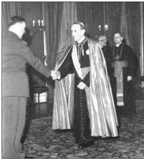
Anton Pavelic with Archbishop Stepinac

In 1929, Mussolini signed the Lateran Treaty with Pope Pius XI officially conceding Vatican Hill to the Pope. The Papacy once again became a sovereign civil state. The legal agreement between Mussolini and the Vatican was just the beginning. Following this, the Papacy formed alliances in the twentieth century with Roman Catholic dictators such as Adolph Hitler of Germany, Francisco Franco of Spain, Antonio Salazar of Portugal, and Juan Peron of Argentina. But the alliance that proved to be the most brutal and bloodthirsty of all was that between the Papacy and Anton Pavelic in Croatia. It was agreed that Anton Pavelic 8 was to be head of the new nation state of Croatia, which was carved out of Yugoslavia during the Second World War.